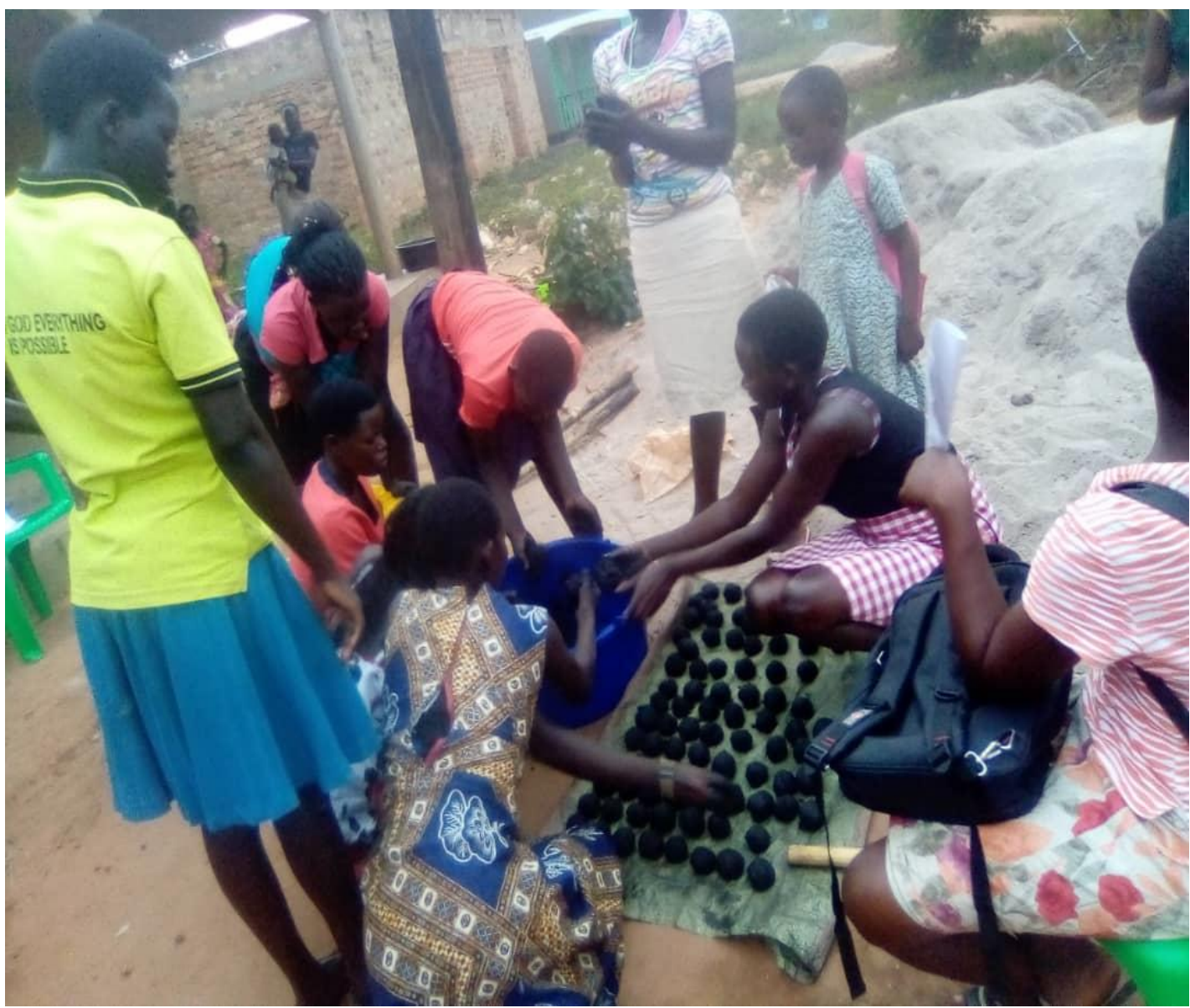
Figure 7. Adolescent girls undergoing charcoal briquette production training