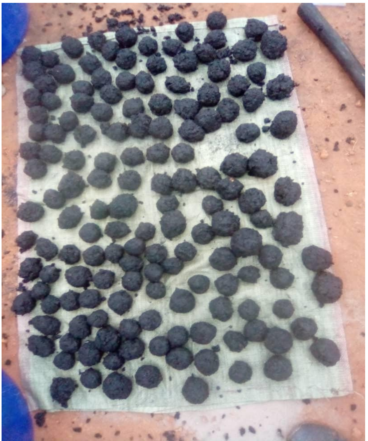
Figure 8. Sample of the briquette produced after acquiring the training