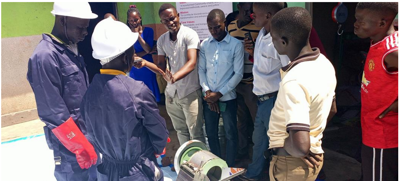
Safe use Training of cassava cipper