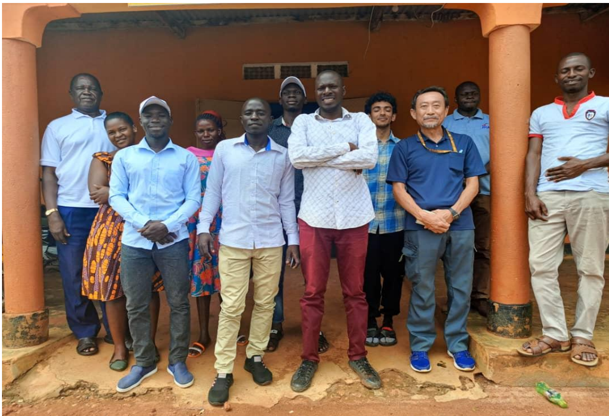
Figure 11. Group photo with JICA Team under Oversea Volunteer program .