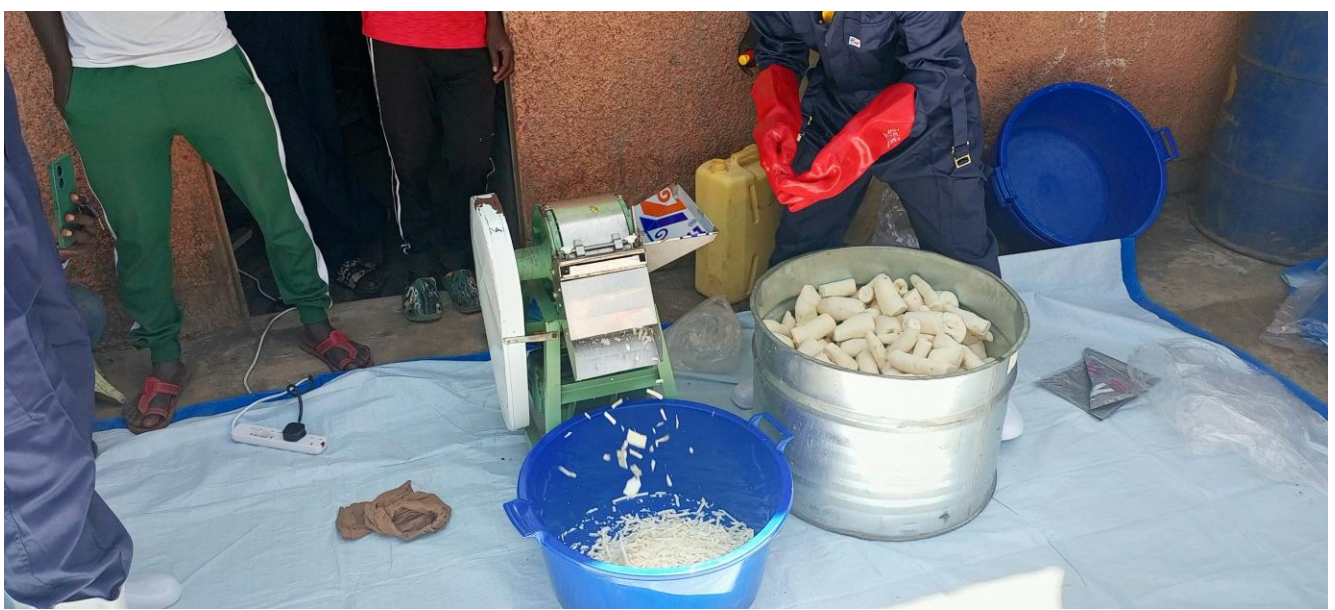
Figure 3. Training on the use of Cassava Cipper