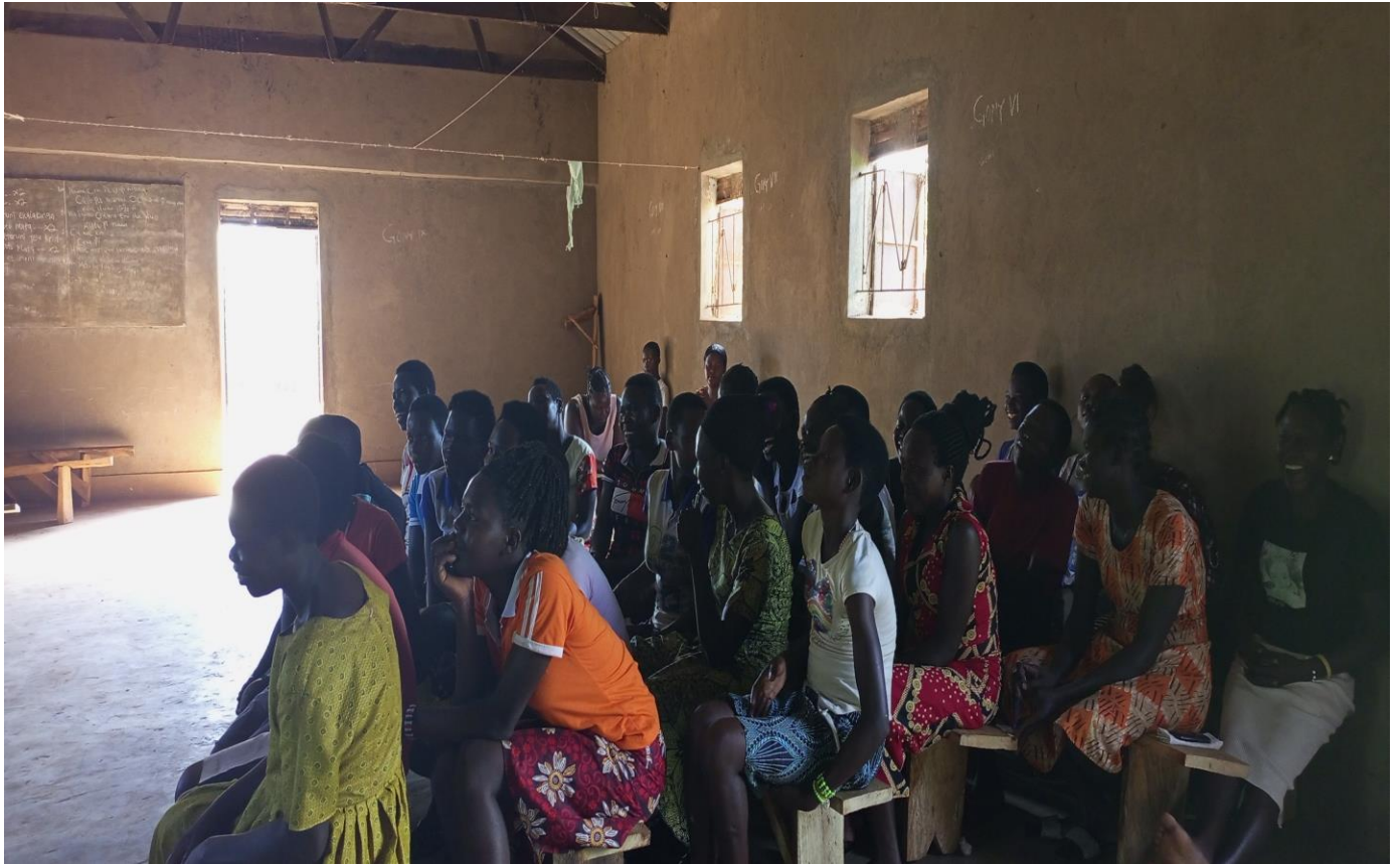
Figure 13. CoC group members during JICA Team Visit