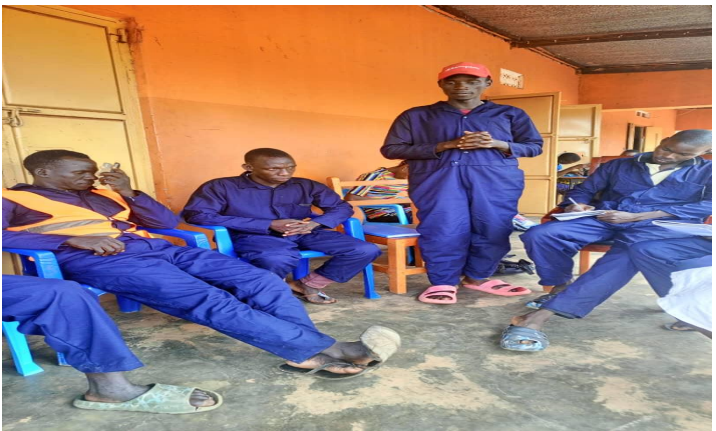
Figure 2. Meeting of pump mechanics