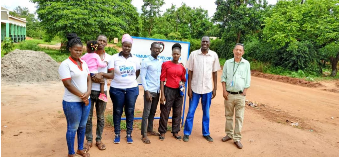
Figure 5. Group photo with US Mission small grants Coordinator during Project Monitoring