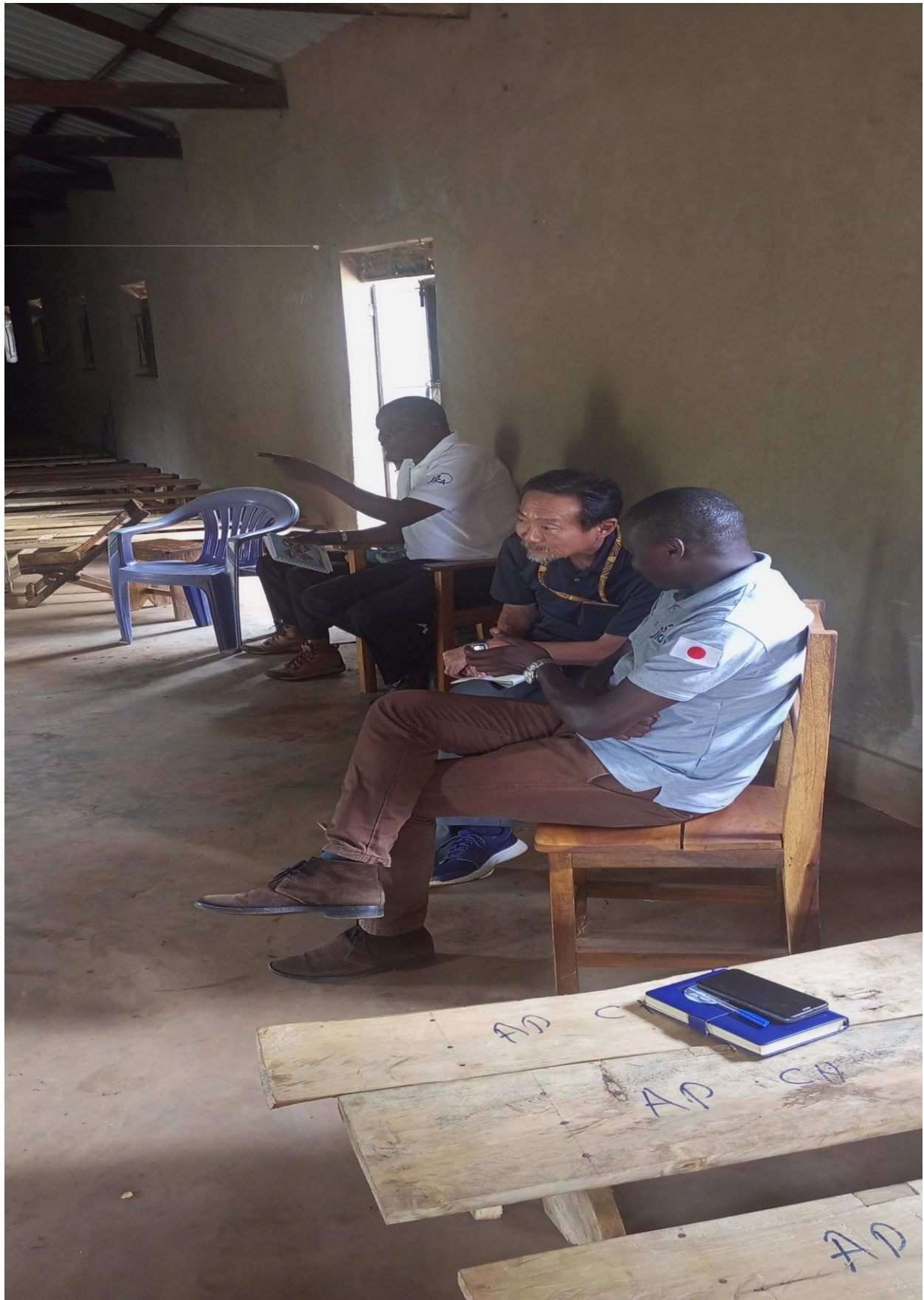
Figure 12. Visit by JICA Team to CoC groups. Preparation under way to send Japanese volunteer to support Community Development Shield Uganda programs in 2025.