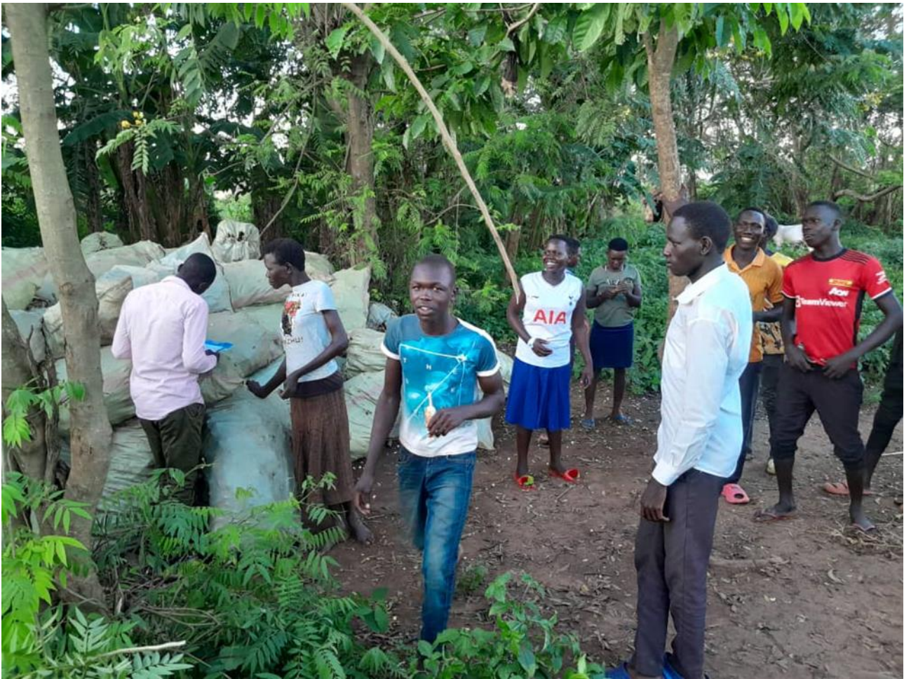
Youth receiving the cassava cuttings, support from CDSU in partnership with Wind wood milers