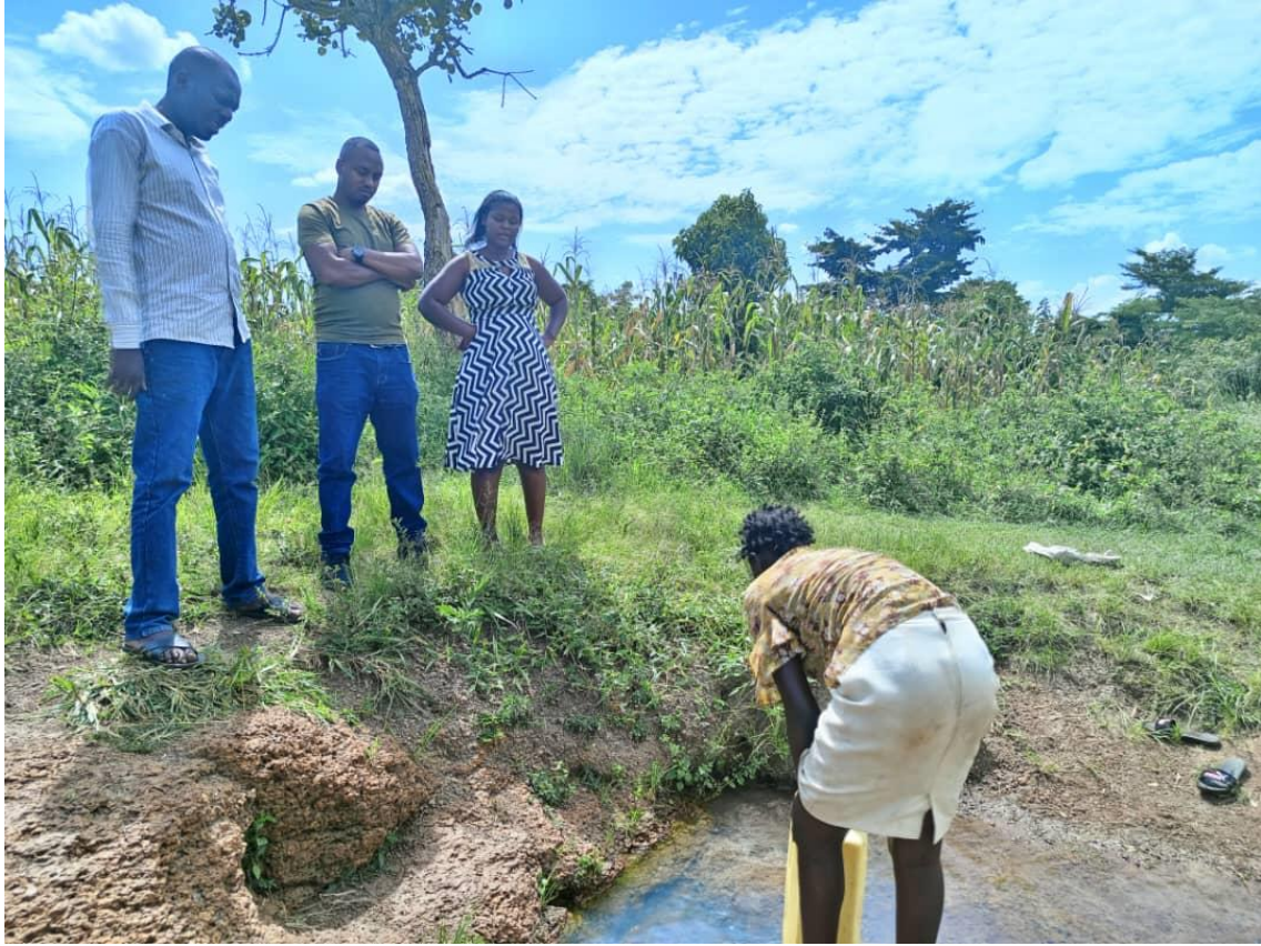
Figure 15. Project Site Visit by MTN Foundation Representative.