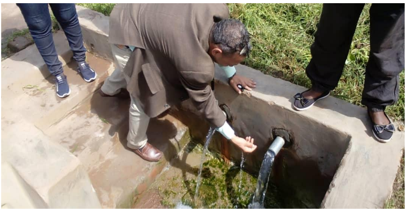
Figure 6. US Mission grants Coordinator conducting Yield testing during project Monitoring Visit.