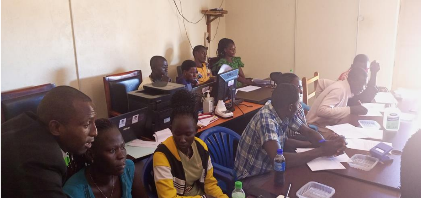
Training youth on Farming as a business