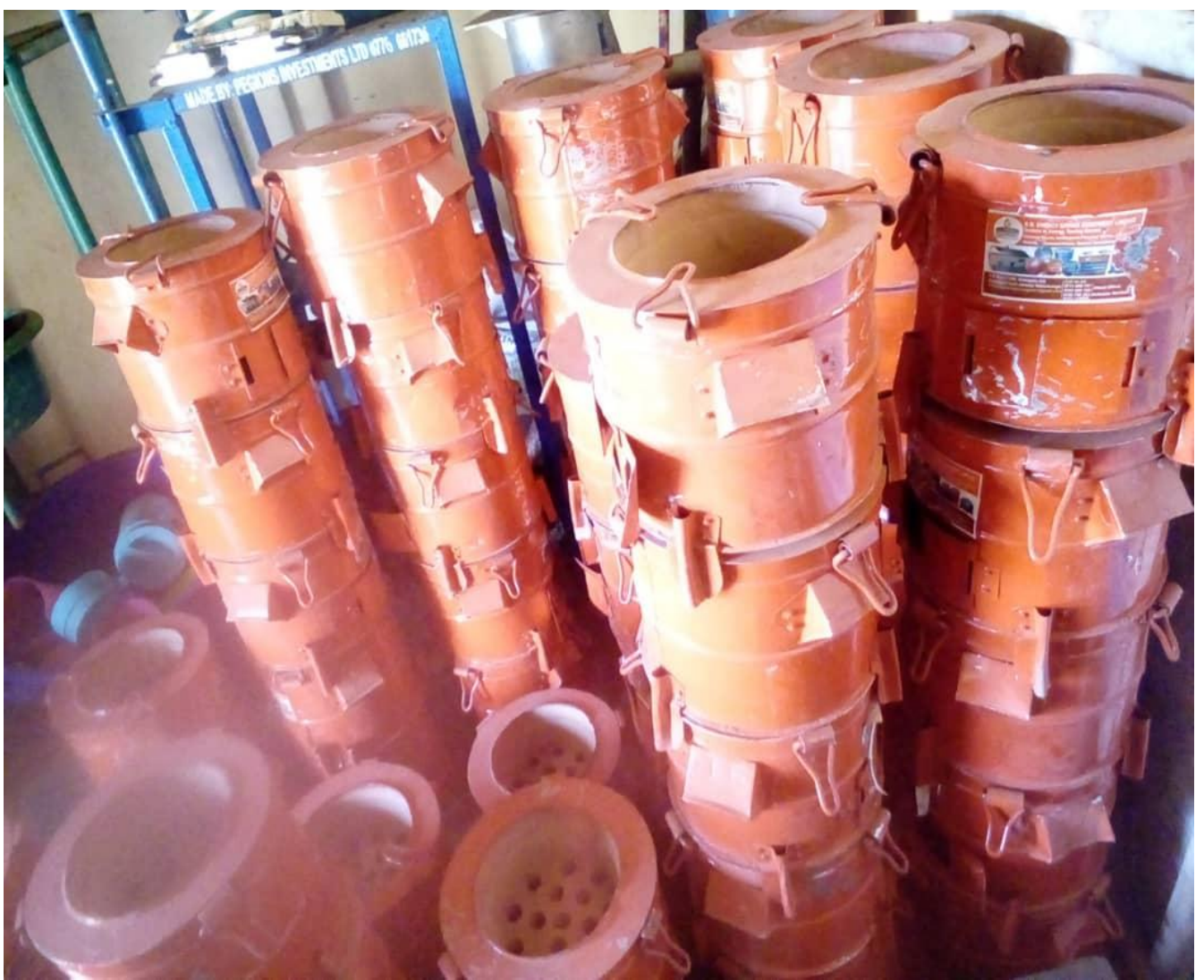
Figure 9. Cook stove Depot