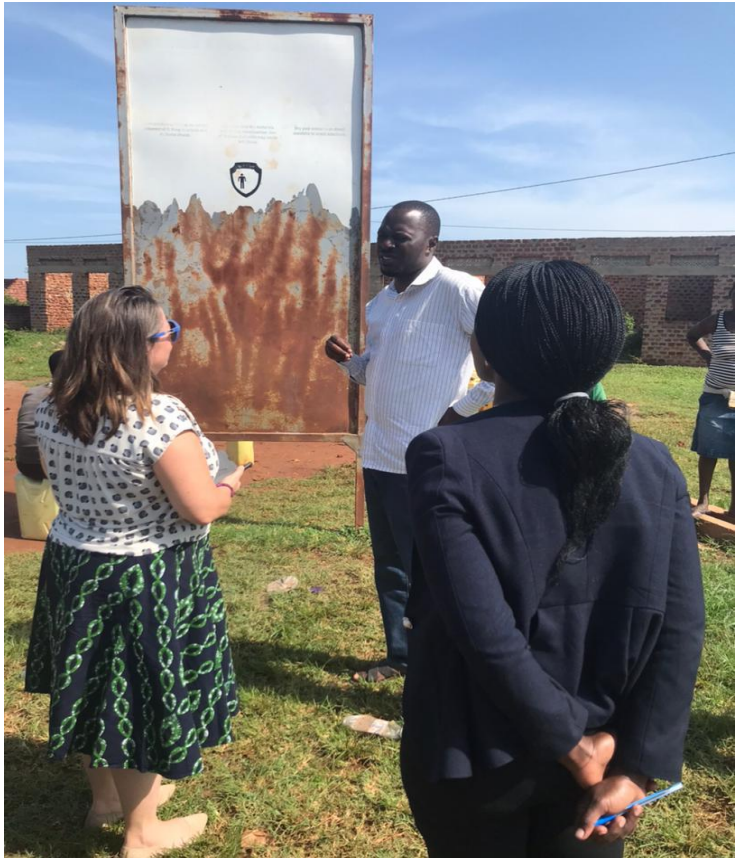
Figure 14. Program Visit by Coordinator PEPFAR project US Mission Uganda.