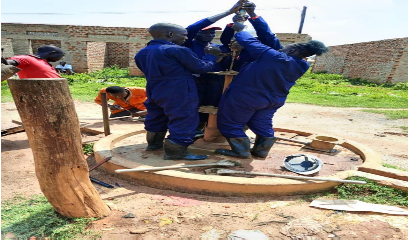
Figure 1. Borehole repair in progress

Improved health and welfare of local communities