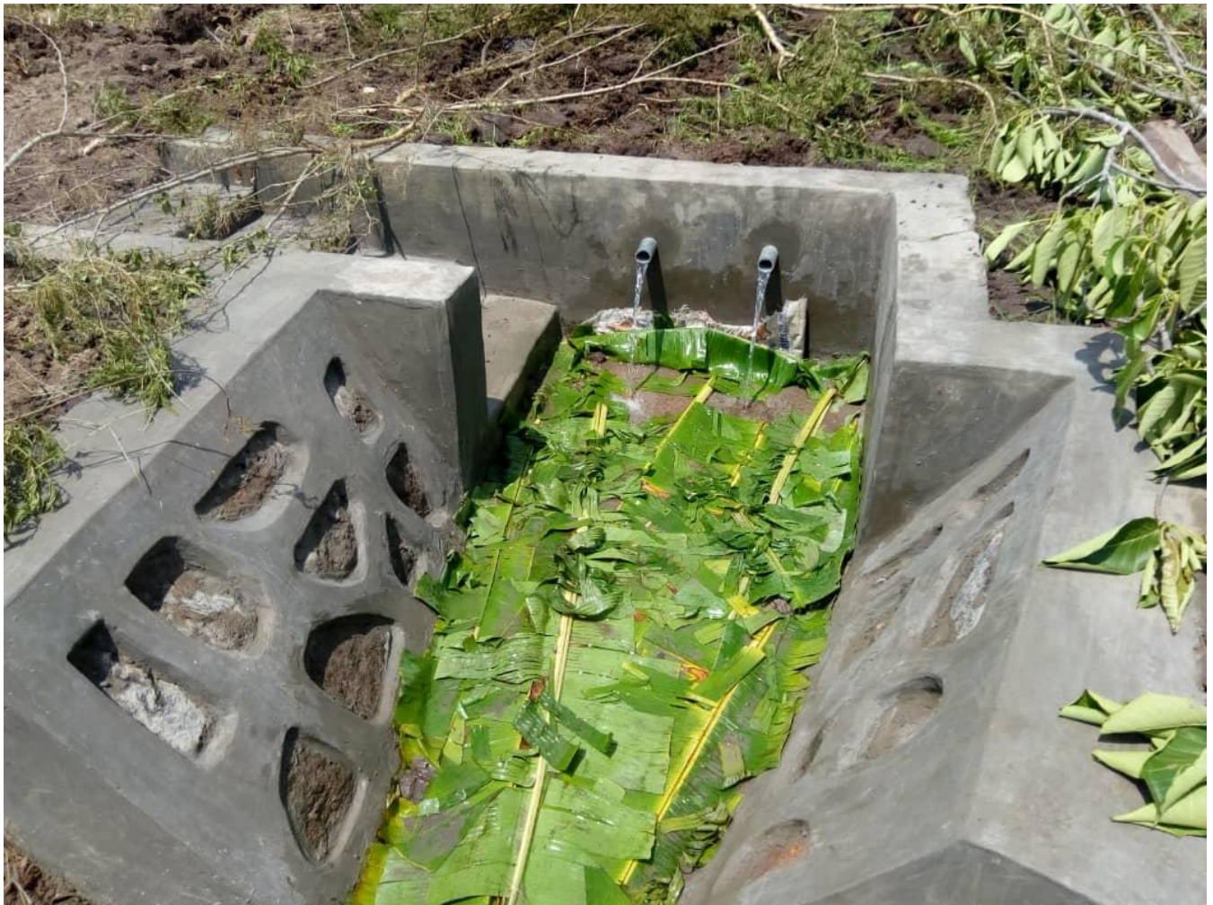
Figure 4. One of the constructed well