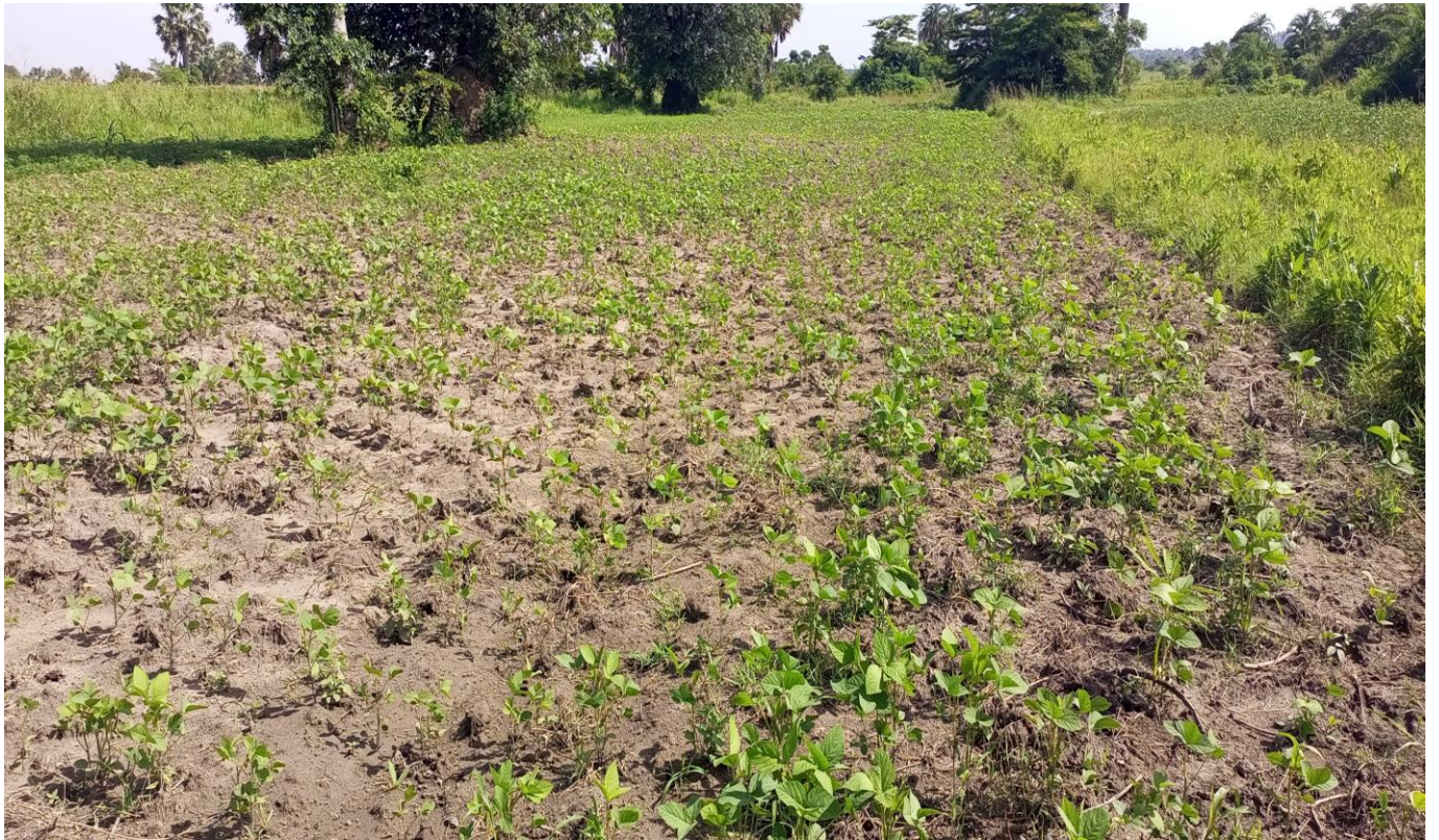
Figure 10. Soya bean Demonstration garden established to support learning